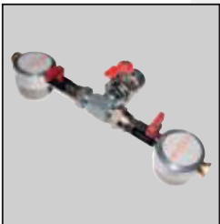
Straight Tee AC.TFK.ST