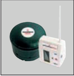
Watchman Sonic GA.WA.ST