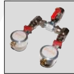
Parallel Tee AC.TFK.PT