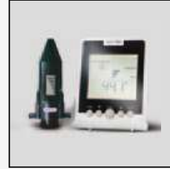
Sonic Smart GA.AP.SM