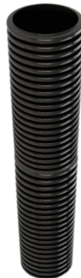
SKU: TW225 I.D: 225mm O.D: 266mm L: 6000mm